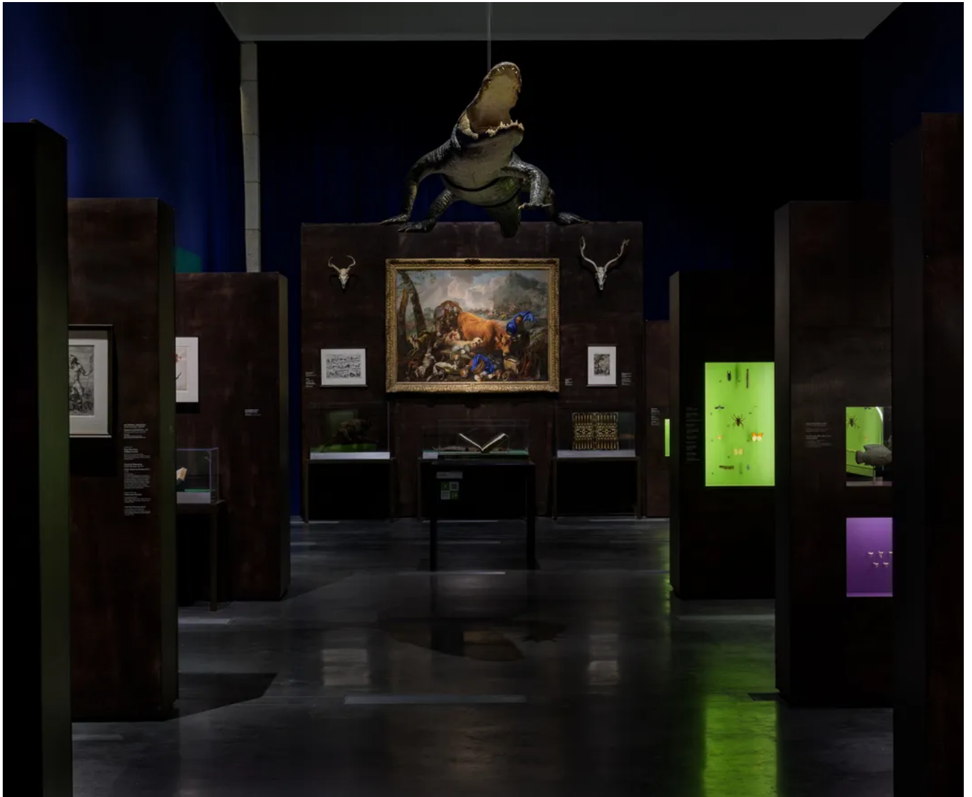
A stuffed crocodile looms over display cases at LACMA.

The show includes little in the way of wall text to guide the visitor, but early cabinets would also have been viewed only in guided tours provided by the collector or staff. The accompanying audio guide features the voices of scholars, artists, scientists and experts from a variety of fields. "I wanted to decenter the voice of the collector and also the voice of the curator," Zumaya says, prioritizing "a greater breadth of expertise and knowledge and ... voices that are not typically heard in art history or museum exhibition contexts." These voices focus on the legacies of colonialism and slavery, and the stories behind the creation or transport of the images and artifacts, continually emphasizing the value of human and animal lives over objects.