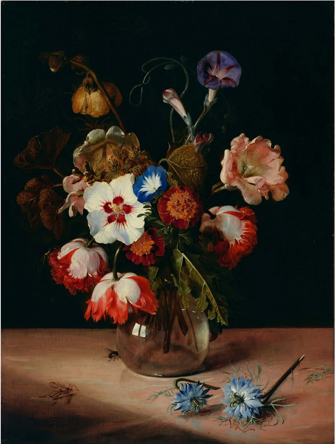
Dirck de Bray, Flowers in a Glass Vase , 1671