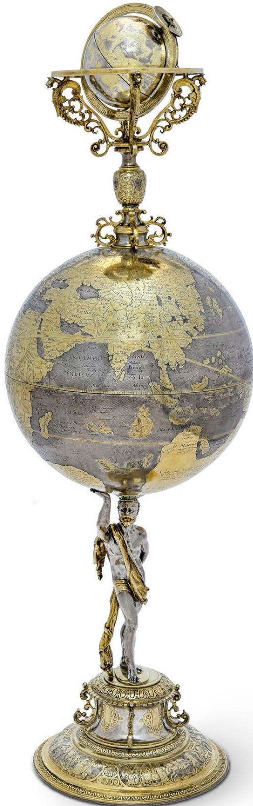
Abraham Gessner, Globe Cup , circa 1600