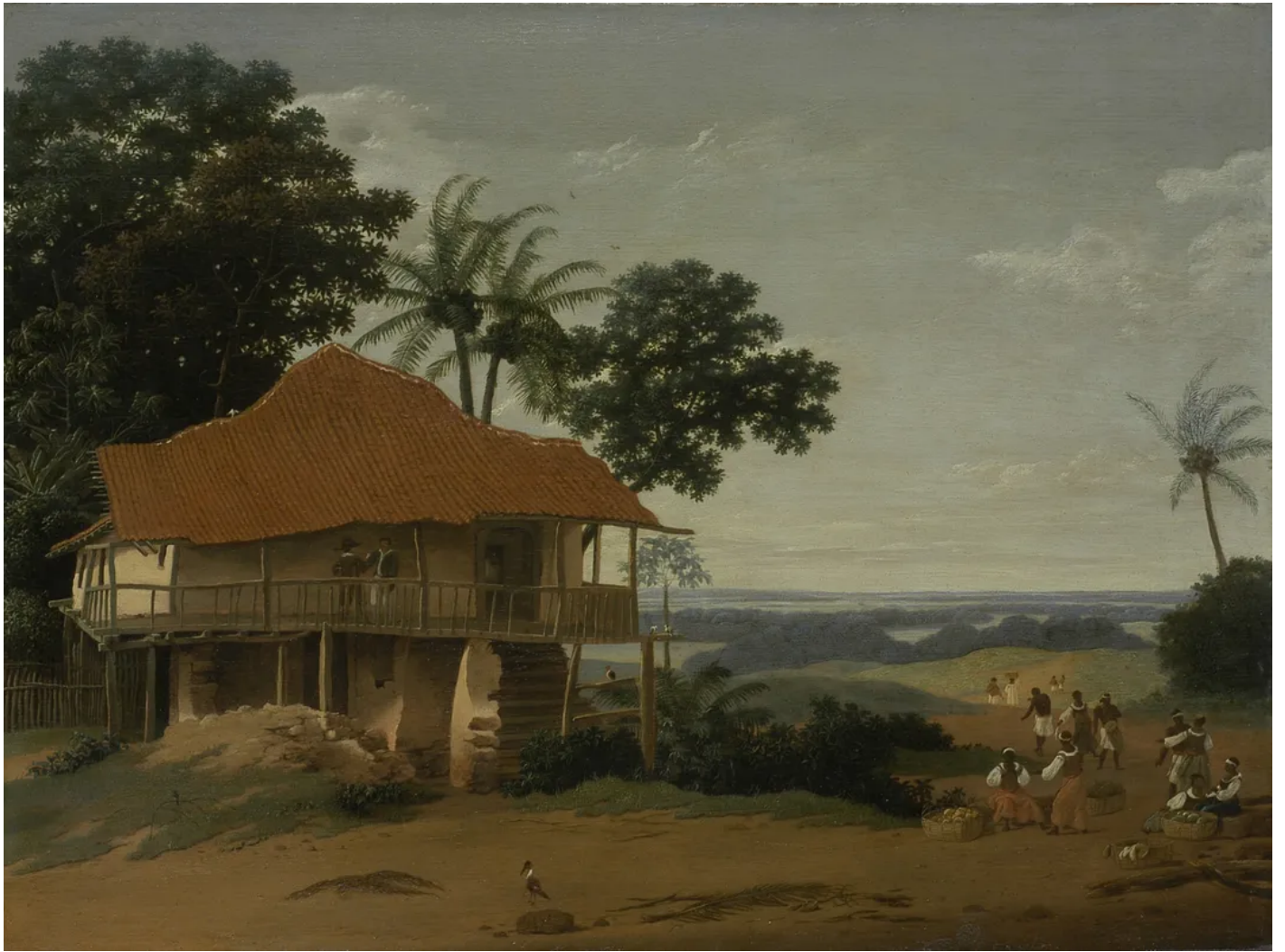
Frans Post, Imagined Landscape of Dutch Colonial Brazil , circa 1655

Modern museums thereby inherited the concept of the global, comprehensive collection—purchased and looted treasures of the world—from cabinets of curiosities. By unpacking the cabinet, “the museum [is] critiquing itself, examining its origins in those collections,” Meadow, who was not involved in the LACMA exhibition, explains. “The point of the [show] is to make visible the European colonial past that relates to the collecting of materials from around the world.”