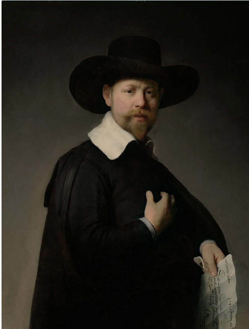
Rembrandt van Rijn, Portrait of Marten Looten, 1632