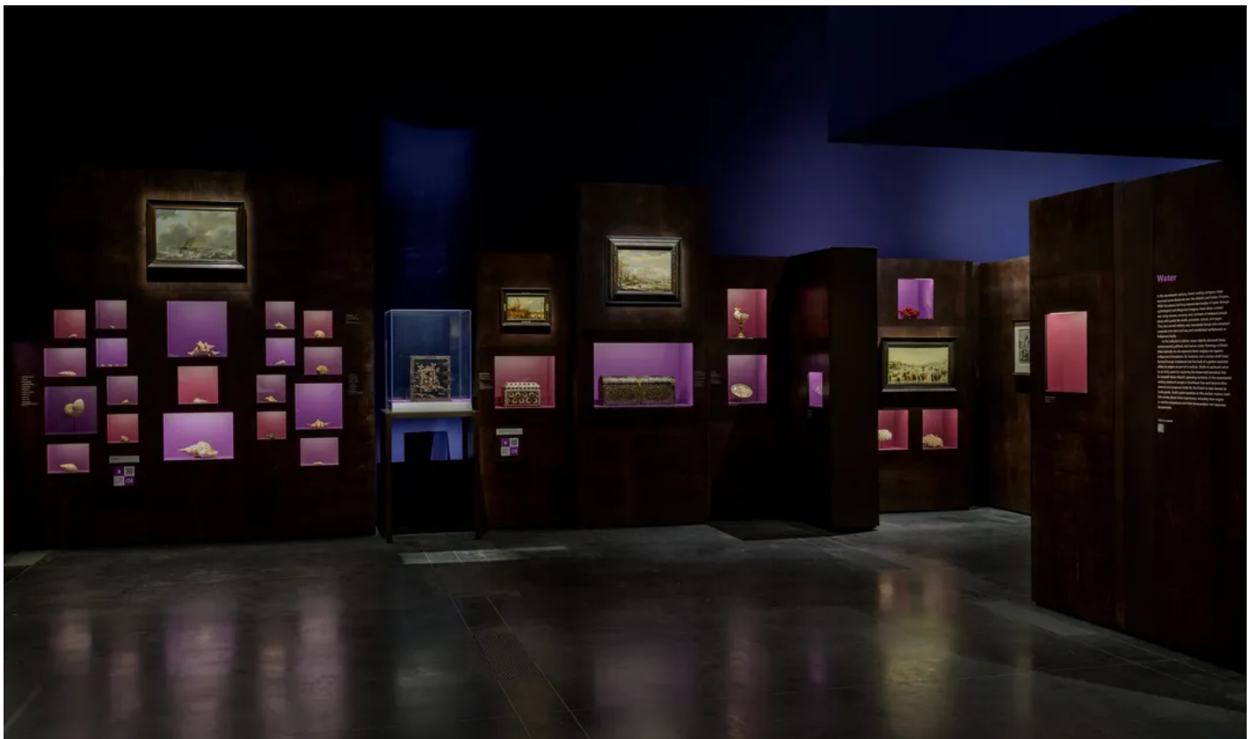
The LACMA exhibition features more than 300 objects, including shells, paintings, prints and gems.