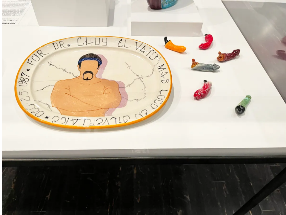
Installation view of “Teddy Sandoval and the Butch Gardens School of Art,” 2023, at Vincent Price Art Museum.

That ASCO piece, Spray Paint LACMA (1972), would serve as a calling card for Chicana art, and would eventually move the museum to mount a solo show for another Chicano artist collective, Los Four, in 1974. It moved me to tears to realize that Chicana painting had moved inward at LACMA, from its exterior to its central galleries, where Baca's murals are now being fabricated.