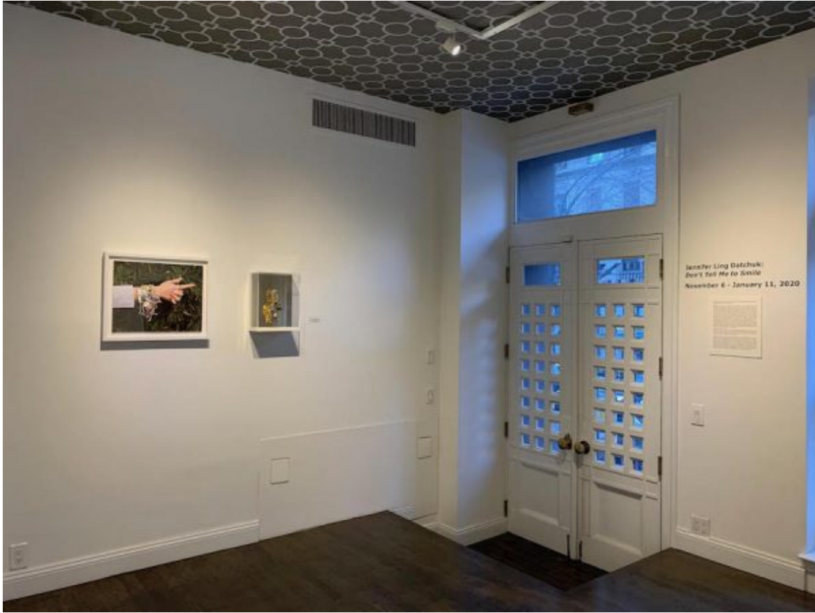
Ruiz-Healy Art, New York location