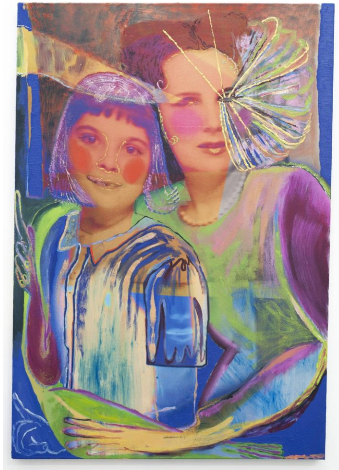
Gaby Collins-Fernandez, Good Girls, 2021, Initials and date on the reverse, Oil and acrylic paint and photo collage on printed terrycloth

The artist says that layering and using multiple elements on one canvas allows the elements to each stand out. “As a strategy, it allows me to equalize categories: color, surface, text, gesture, materials—all function as a kind of language within the work,” Collins-Fernandez said, in a statement.